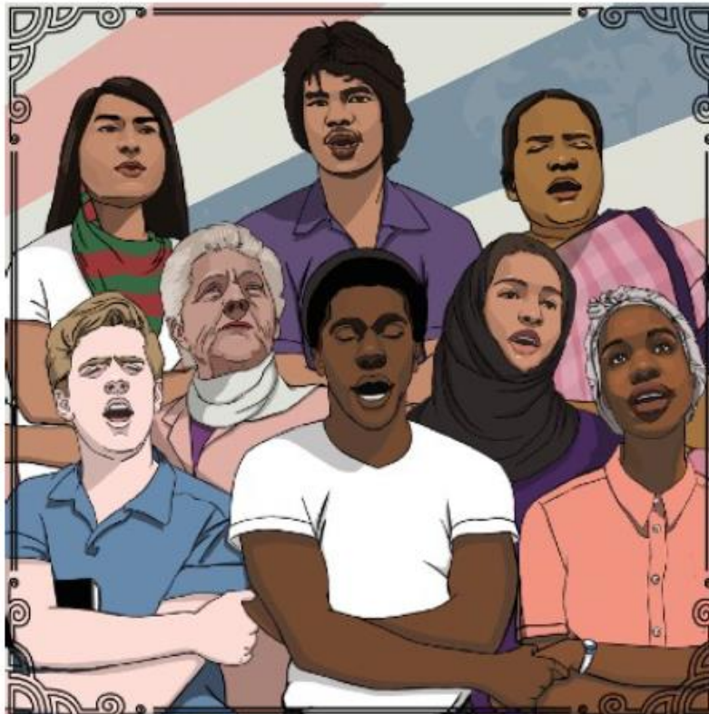
3. Glass Artwork, Right Pane (5' in length x 5' in height x 19/32" in depth)