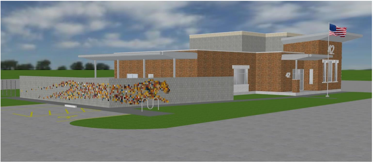
Burning Bright, Full View of Fire Station #42 (71' 3 1/2" in length x 6' 9" in height x 4" depth)