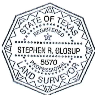
EXHIBIT "A" PUBLIC RIGHT-OF-WAY VACATION OF A PORTION OF PENNSYLVANIA AVENUE CITY OF FORT WORTH, TARRANT COUNTY, TEXAS