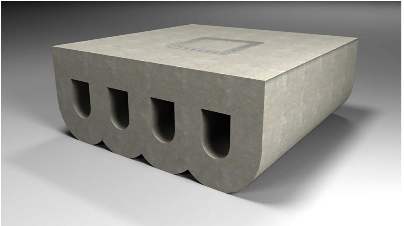
2. Concrete Sculptural Plinth (4' in width x 4' in depth x 1.5' in height)