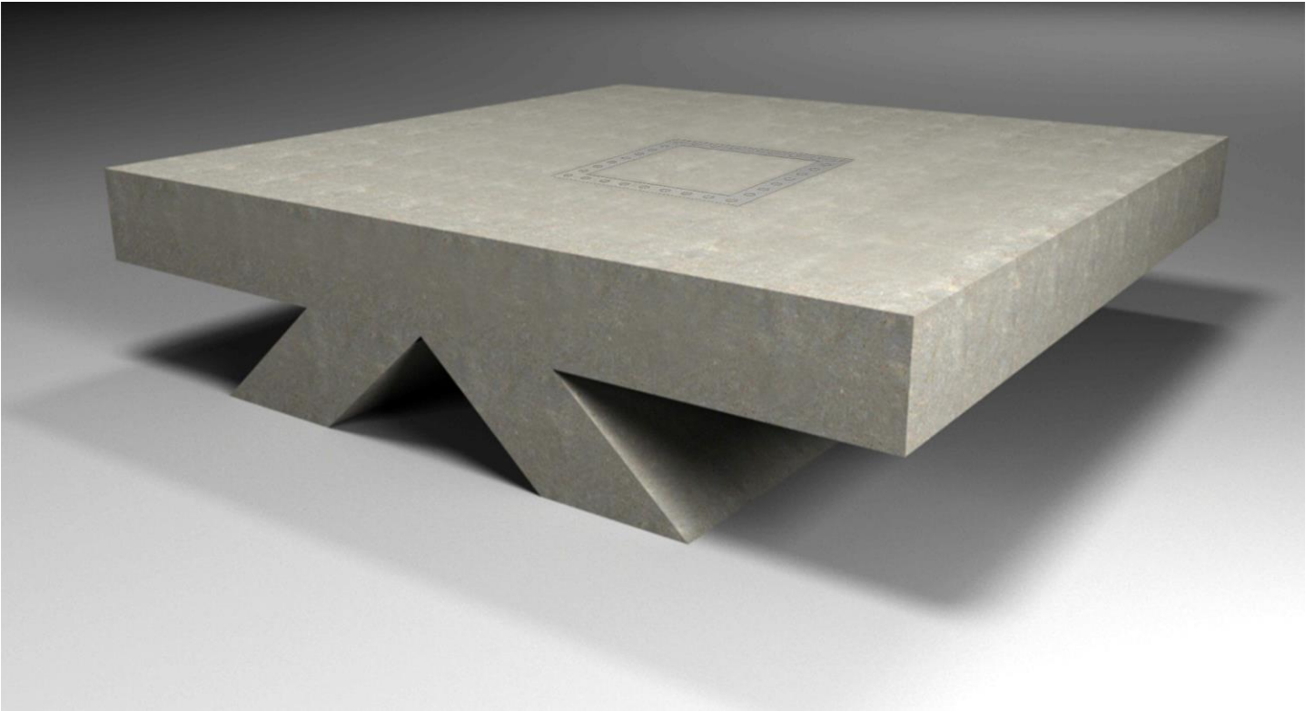
3. Concrete Sculptural Plinth (6' in width x 6' in depth x 1.5' in height)