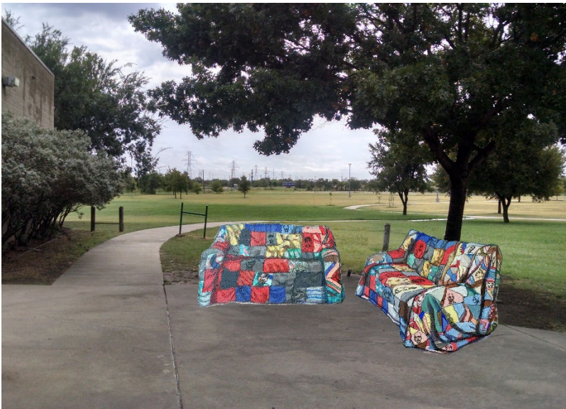
design sketch of artwork on site

Artwork for the Highland Hills Recreation Center is “The Welcome Space,” is an installation that mimics an interior room. The artwork is composed of two sculptural benches approximately six feet long and will be placed near the recreation center entry. The benches are clad in hand-sculpted tile that looks to be draped and folded, reminiscent of a sofa covered by a quilt. The sitting area is one that recalls the African American artistic legacy of quilting and hand-made craft. Its bright, jubilant color reflects the celebratory palette in many traditional African cultures. In part it is a reminder of the African American heritage that is prevalent in the Highland Hills community. On the other hand the cultural quilts are acknowledging the quilted past of the community, with its changing demographics over the years. The patches of the quilts also feature portraits of people of different ages and genders, and will be relatable to everyone while not naming anyone specifically. The installation is a way of being seated among the excellent patchwork of community members who have graced the neighborhood over the years.