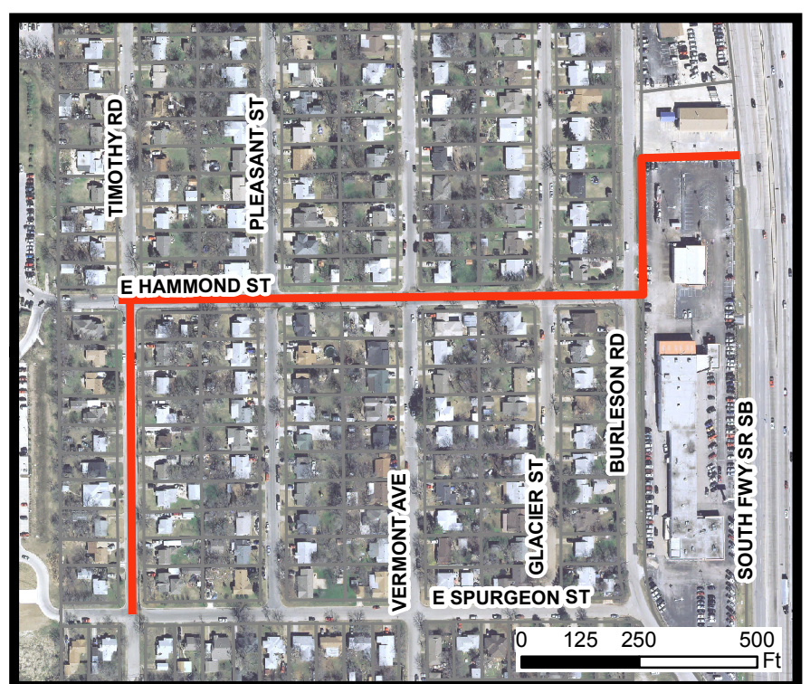
DETAIL OF PROJECT LOCATION