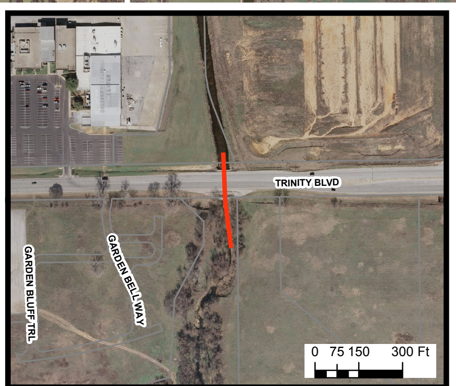
DETAIL OF PROJECT LOCATION